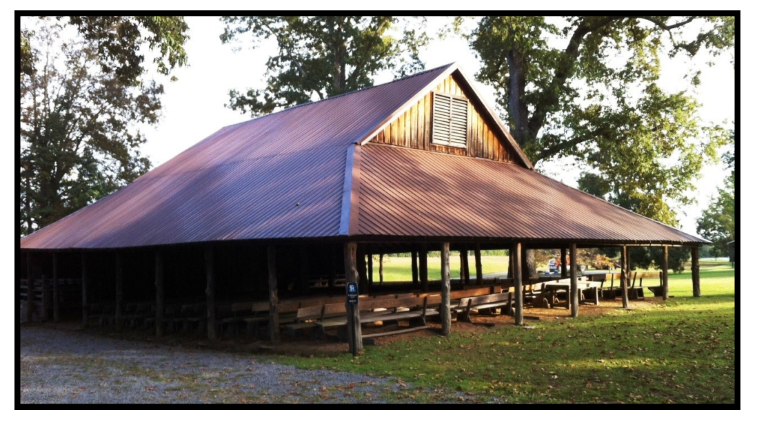
Sunday to Friday — June 20-25, 2021